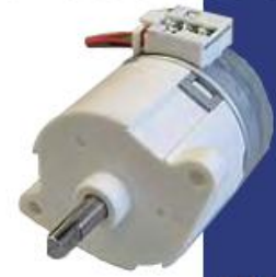
PM Motor PG Type