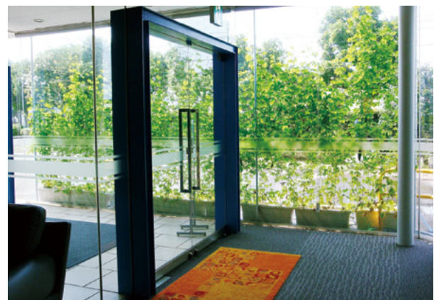
A "green" curtain used to save power (Fujisawa Plant)