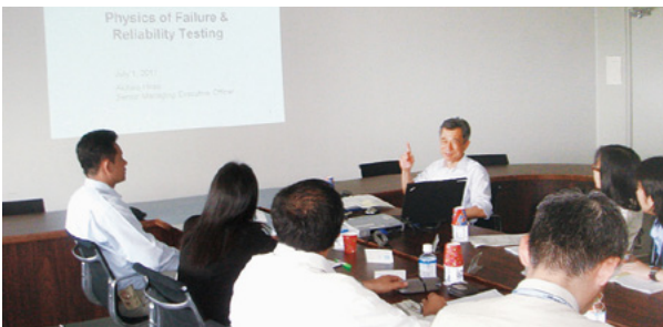
Employees taking part in a training session

In FY2011, six representatives of the Thai business units participated in quality improvement team training as a way to further enhance product quality. The two-week training program at the Hamamatsu Plant included lectures on quality assurance and practical training on approaches to quality issue resolution.