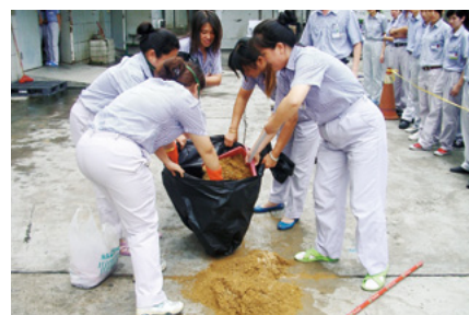
Training to prevent leaks of chemical substances during an emergency drill (Zhuhai Plant)

Health and safety courses are a required part of the training for new employees. The training helps to instill a proper understanding before the new employees are assigned to a division. Training continues even after employee assignment as part of the daily efforts to prevent accidents at the plant.