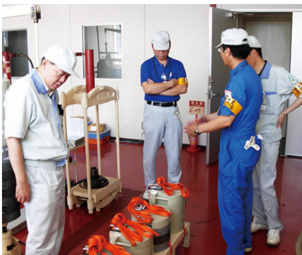
A patrol at the Fujisawa Plant

Regular safety patrols are conducted monthly at every group plant, including the Karuizawa Plant. These patrols monitor progress against the previous month's findings, identify further areas needing improvement, and ensure that areas near production equipment are neat and tidy, that potentially dangerous tools are stored properly, and that safety glasses and earplugs are used.