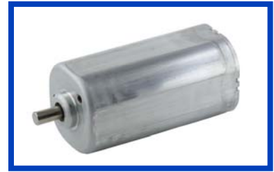
Weight : 208 g