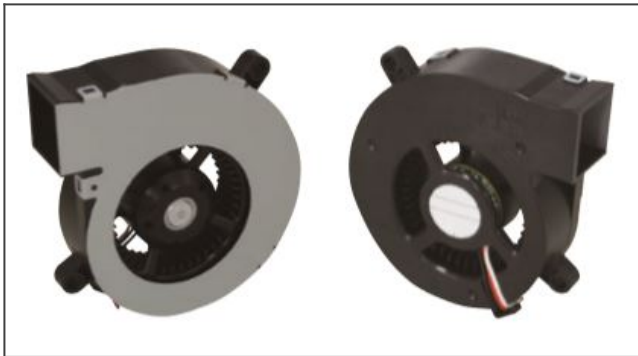
06920GA product picture